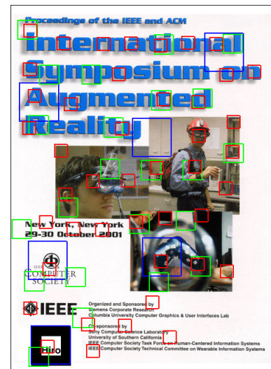
Fig.1 An example of tracked texture and extracted features

We will show this real-time tracking demonstration by using a laptop PC with Pentium 4 2.0GHz cpu.